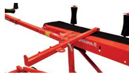
The transport support is pulled out from the arm and over the infeed conveyor.

Transport support allows you to move the firewood processor and the log lifter quickly in the working area. For road transport, log lifter needs to be set in transport position and attached to the processor according to user manual.