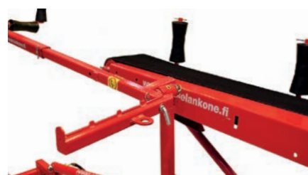
The support is integrated inside the arm.