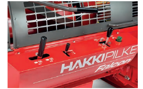
The ergonomic and easy-to-use control panel makes the machine easy to operate.