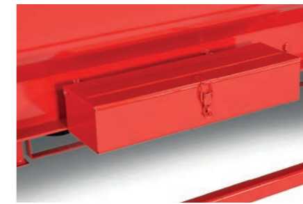
Convenient tool box as standard.