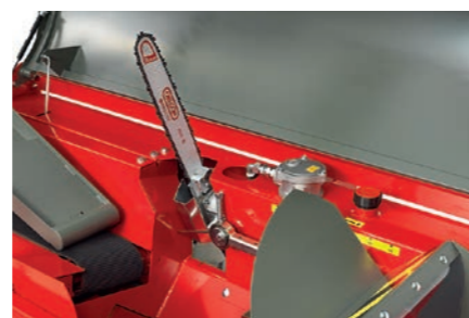
Effective hydraulic saw.